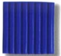
Reverse: Eight segments

Colours may vary due to printing process.