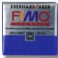
FIMO CLASSIC 63g - Block