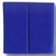
Front: Two segments